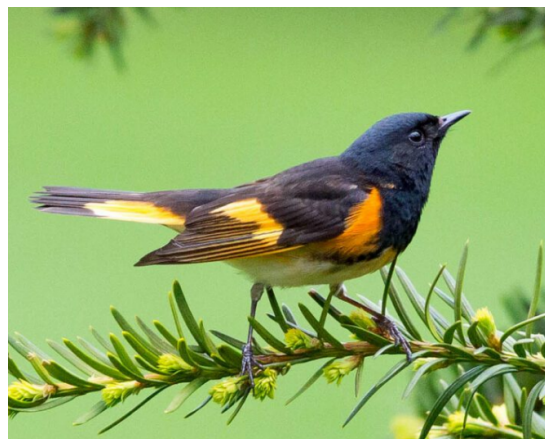
American Redstart