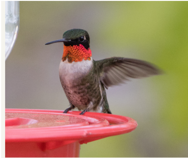
Ruby-throated Hummingbird at feeder