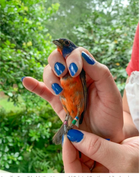
Jennifer Tyrrell holds the 14-year-old Painted Bunting while showing off its bands.