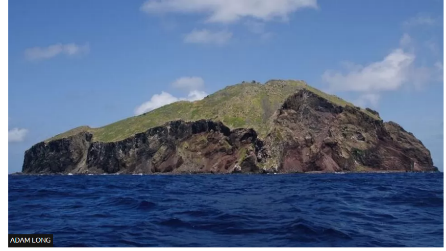
Now, the island is much greener

From the BBC comes a story from Redonda, a Caribbean island that Antigua and Barbuda worked to restore so that today it is "bursting with biodiversity including dozens of threatened species, globally important seabird colonies, and endemic lizards." Work began in 2016 to remove the invasive black rats that "preyed on reptiles and ate birds' eggs, along with goats introduced by early colonists that devastated Redonda's vegetation and had left the island looking like a barren moonscape. ... The work was piloted by local NGO, the Environmental Awareness Group (EAG), in sync with the government and overseas partners including Fauna and Flora International (FFI). Today, the island has been officially designated a protected area, the Redonda Ecosystem Reserve, by the country's government, ensuring its status as a pivotal nesting site for migrating birds and a home for species found nowhere else on Earth is preserved for posterity. ... Since the efforts began, 15 species of land birds have returned to the island, while numbers of endemic lizards like the critically endangered Redonda ground dragon have soared." Redonda: Tiny Caribbean island's transformation to wildlife haven - BBC News