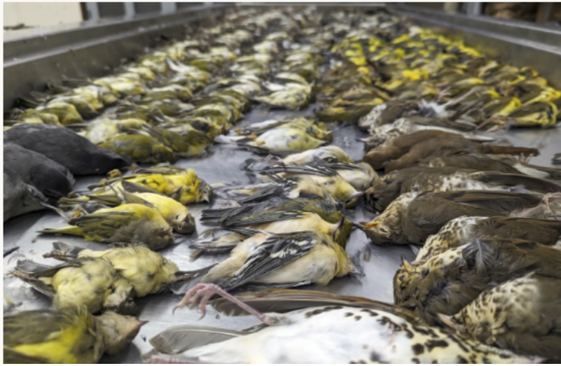
Field Museum Photograph

As a follow-up to the recent mass bird casualties as a result of collisions between birds and glass at McCormick Place in Chicago, many groups have been trying to educate the public and bring attention to the issue. Bird Friendly Chicago: Chicago Bird Collision Monitors, Chicago Ornithological Society, and Chicago Audubon Society have created a community petition that would require exhibitors to agree to these conditions of turning off lights and closing the curtains at night in the glass structure because doing so is a responsibility that the Metropolitan Pier and Exposition Authority (MPEA) cannot control on their own. This petition will be presented to MPEA at their next meeting on Tuesday October 24th , if possible. Copies will also be delivered to the Mayor and Governor. Please sign and share this petition: McCormick Place: Keep the Lights Out | Audubon Community Petitions . A short social media YouTube video by Badgerland Birding can be viewed here, although, to be fair, some of the discussion may contain misleading comments that may be disputed by the building managers: A Chicago Building Killed Over 1,000 Birds in One Morning: Here's How You Can Help - YouTube