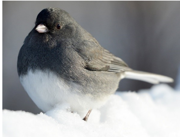
Dark-eyed Junco

Discover what Ohio birds are up to when winter sets in! This self-guided hike will be on display along Seneca Trail through November 9. This activity counts toward Fall Hiking Spree.