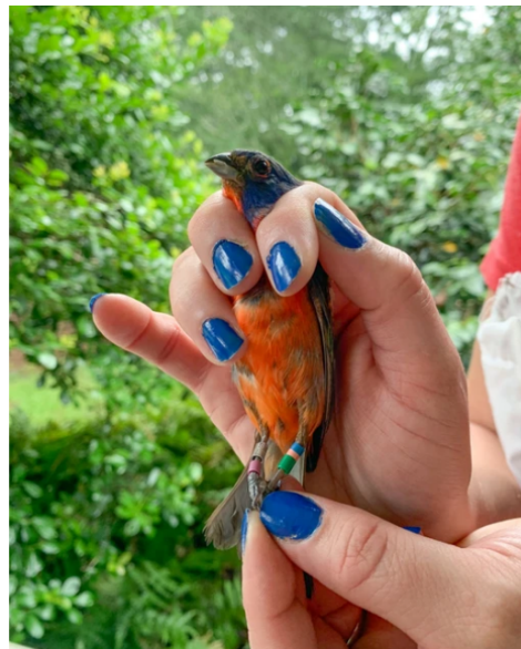
Jennifer Tyrrell holds the 14-year-old Painted Bunting while showing off its bands.