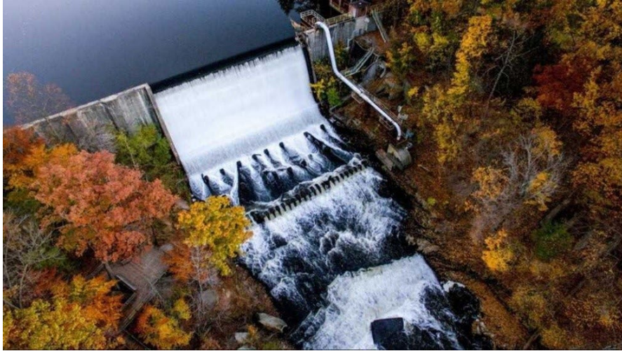
Gorge Dam

For anyone interested in the process of the removal of the Gorge Dam but did not attend the public meeting held on October 31, 2022, you may be interested in watching a recording of the presentation by the various organizations involved ( Free the Falls Public Meeting - October 31st, 2022 - YouTube ). Of key interest may be the discussion of the sediment disposal area in Cascade Valley Metro Park, beginning at 25:38 on the recording. A 30-acre area off of Peck Road, near the Chuckery Trail, will soon be cleared in preparation for the future deposition of the sediments that will be removed from behind the dam. The recording summarizes all the work done to date as well as the tentative timelines for the sediment dredging, transport and remediation, as well as the actual dam removal. The Highbridge Trail will be used as the piping route for the transport of the sediments and will therefore be closed to public use for about 2 years beginning in 2024 if all remains according to schedule. If you are interested in receiving ongoing updates about the progress of the dam's removal or would like to understand the process better, please visit Summit Metro Parks' Free the Falls page: Free the Falls: A project of Summit Metro Parks and its partners .