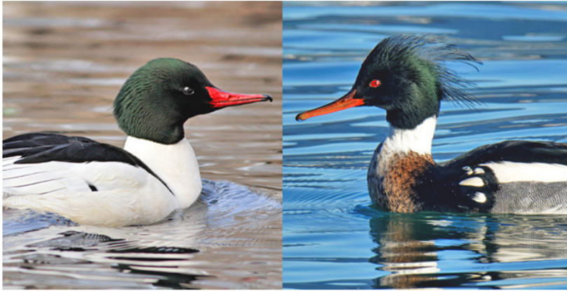
Mystery birds

It's that time of year for waterfowl and we can all use a refresher with IDs. Cornell Lab of Ornithology recently had this quiz in an email: