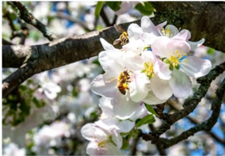
Honeybees pollinating the flowers of an apple tree.

American Bird Conservancy has championed the widespread halt of the use of neonics for over a decade, but now our grocers are realizing that these toxic pesticides are also as much a threat to biodiversity collapse and our own food supply as climate change. Whole Foods and Kroger top the list of national grocers who are forcing food and flower growers to comply with a ban on neonicotinoids. And other grocers such as Giant Eagle, Walmart, Aldi, Costco, CVS, Dollar Tree, Meijer, Rite Aid, and Target are implementing policies that encourage reduced use of these chemicals but without targeted metrics.