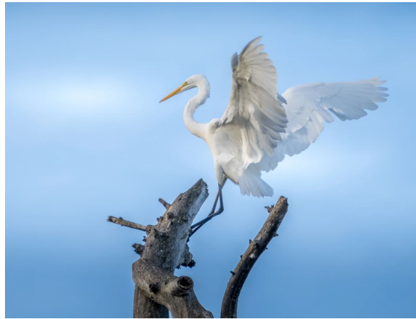
Great Egret.

Audubon's 2024 grant program is funding chapter projects that contribute toward Flight Plan, Audubon's strategic plan for 2023 through 2028. Audubon Collaborative Grants provide financial support up to $1,000. Canton Audubon Society was the only Ohio chapter awarded a grant in this year's cycle. A description of their project follows: