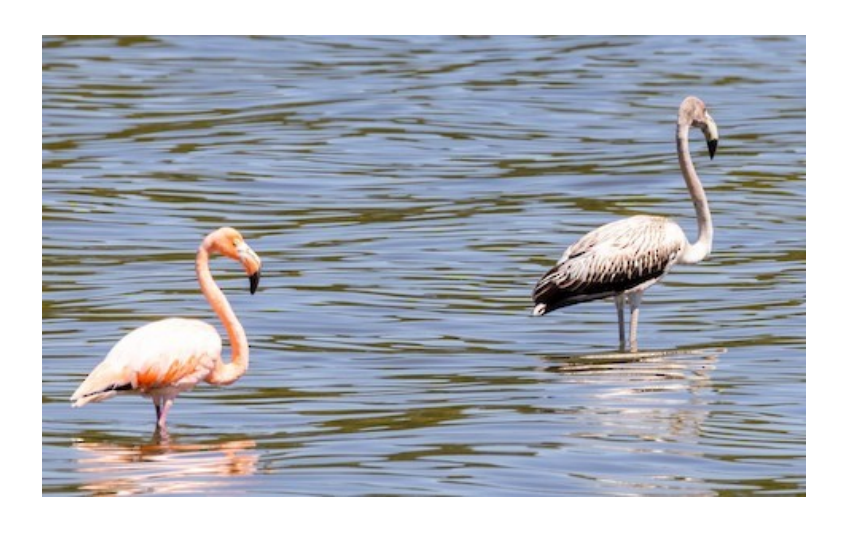
American Flamingo