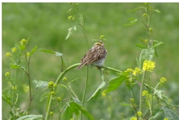
Savannah Sparrow at PPG's Lime Lake #6