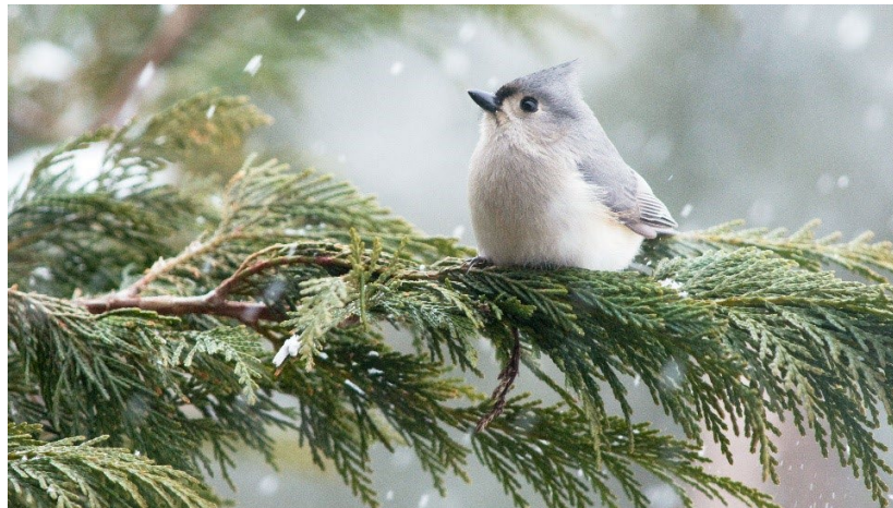
Tufted Titmouse.

The order forms for the Wild Bird Seed Sale were recently mailed to all National Audubon members who live within the bounds of our chapter's territory and to those who may have ordered seed in prior years. The opposite side of the card shows our upcoming speaker programs for the 2022 – 2023 year. If you did not receive the orange postcard, you can find the Order Form on our website here: Greater Akron Audubon Society annual wild bird seed sale . The deadline for orders is October 28 th and pick-up is from 10:00 a.m. – 1:00 p.m. on Saturday, November 5th at Copley Feed, 1468 S. Cleveland-Massillon Rd.