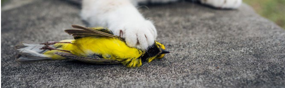
Hooded Warbler killed by cat, forestpath/Shutterstock

Keep Cats Indoors: Predation by domestic cats in the outdoors is the number-one threat to birds in the U.S. and Canada.