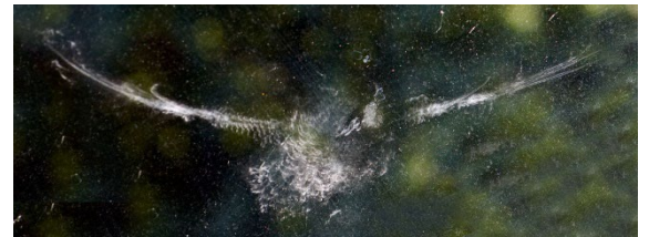
Window imprint from bird collision.

Prevent Window Collisions: Birds don't have the ability to perceive transparent glass and they perceive reflected images as real, especially when they appear to be inviting shelter or food sources. The American Bird Conservancy's collision experts offer answers to the most frequently asked questions and advice: https://abcbirds.org/blog/truth-about-birds-and-glass-collisions/ .